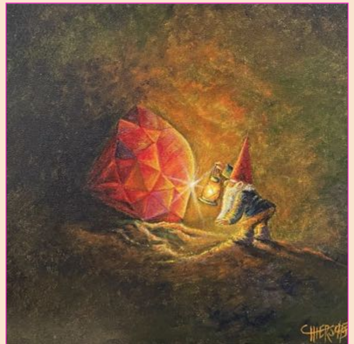
Gleam In The Grove