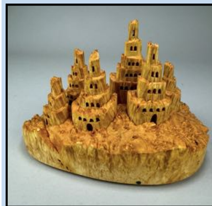
By Uli Kirchner