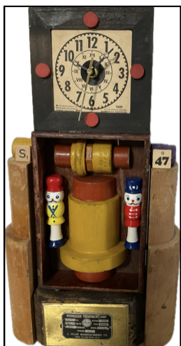
By Ann Durley - clocks