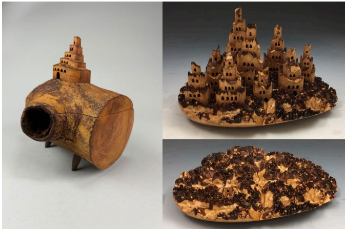
BY Uli Kirchner

Many pieces are spalted (marked by natural fungal patterns), and he treats them like pigments. He also embraces imperfections like knots, holes, and cracks — adding in materials found on hikes: twigs, rice, stones, eggshells.