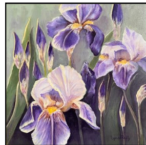
Purple Irises by Lynn Reilly