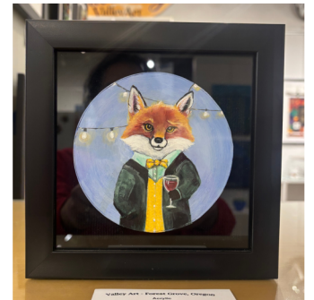
"Cheers" by Roylene Read