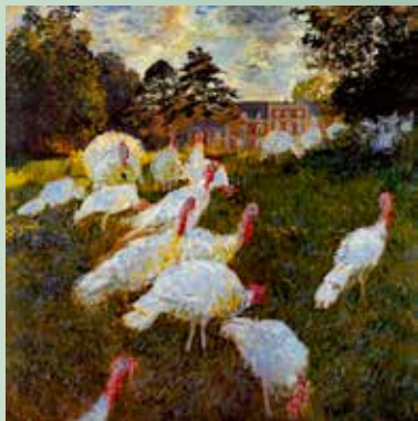
CLAUDE MONET, THE TURKEYS, 1877, OIL ON CANVAS