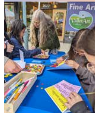
A big thanks to all our helpers.