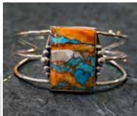
JEWELRY - JIM HAYES